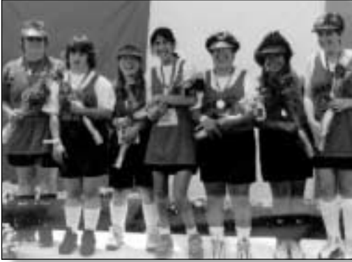
The Special Olympics Girls Volleyball team, from the City of Torrance, serves up another win.

The Torrance Special Olympics Team offers a year-round program for developmentally disabled individuals age eight and older. Practices include participation in both individual and team sports including basketball, soccer, track and field and many others.