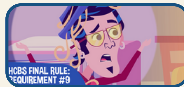
HCBS Requirement #9: Right to Visitors