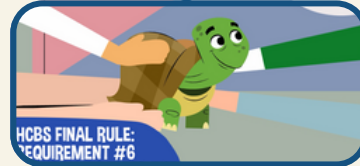
HCBS Requirement #6: Tenant's Rights