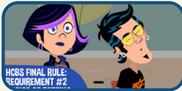
HCBS Requirement #2: Choice of Setting