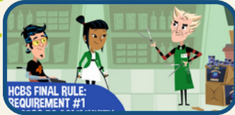
HCBS Requirement #1: Access to Community