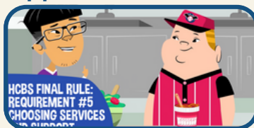
HCBS Requirement #5: Choosing Services and Supports