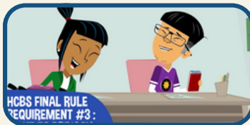
HCBS Requirement #3: Right to Privacy