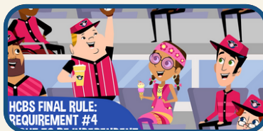
HCBS Requirement #4: Right to be Independent