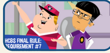
HCBS Requirement #7: Privacy at Home